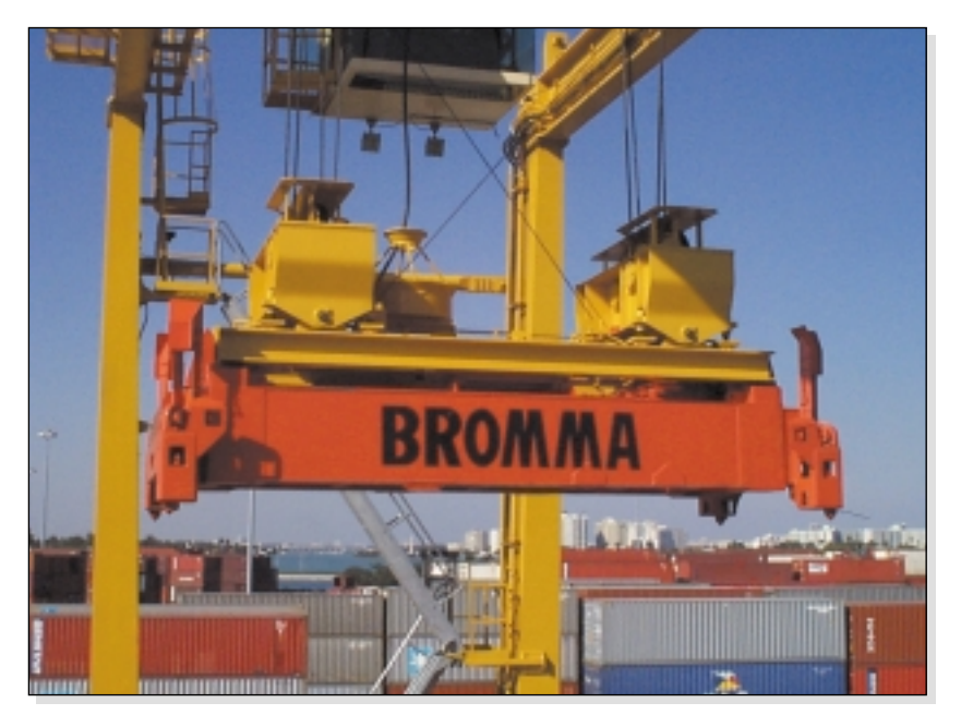
Specially designed Interface Frame on new Mi-Jack RTG for the Port of Miami Container Terminal