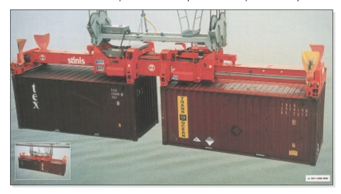
Figure 3 Stinis Long-Twin lift Gantry Crane Spreader

The increasing use of twenty-foot containers by shippers on deck and in forty-foot cells has driven operators to find new ways of increasing productivity by handling two twenty-foot containers at the same time. This has led to the increasing use of twin-lift spreaders and innovative designs by the spreader manufacturers (Figure 3). The purchaser now has the option of a simple twin-lift or an adjustable twin-lift spreader. The