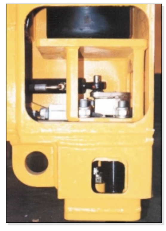
Figure 7 New shock absorbent system on RAM spreaders

a better chance of obtaining the proper equipment than government regulated organisations. This is primarily due to the different selection procedures. One specific selection criterion that is commonly used is to buy from the lowest bidder. This type of selection may result in substandard equipment and services. A well known saying best summarises the outcome of these selection procedures: 'pay-me-now or pay-me-later'.