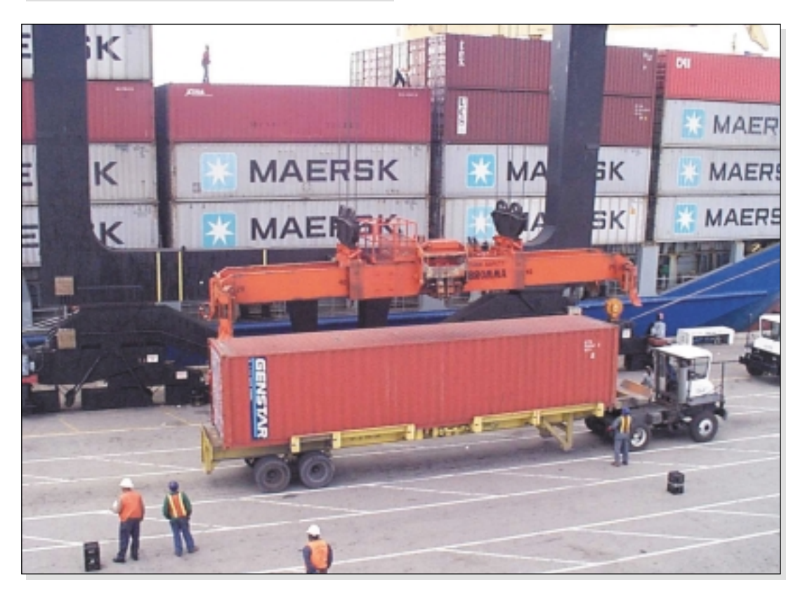
Twin-Lift spreader offloading a Maersk ship

The most abused item on a container crane is the spreader. Since the spreader is the only crane component which physically contacts the container, it is also the component most susceptible to damage from impact loading, operator miscalculations and abuse. Yet, even though it is subjected to these conditions, a spreader should continue to function properly. Failure of this component can cause operations to cease or, in the worst case, an accident with injuries and property losses. If the spreaders have the proper operational components and are given the proper maintenance, they will be very efficient, giving the terminal operator a high pick volume. In this article we will analyse the issues involved in purchasing, maintaining and operating fixed and telescopic container crane spreaders in the marine terminal industry (Figure 1). We will also present the current market and terminal operator trends based on information obtained from an informal survey of the industry, which resulted in responses from 13 of the world's major marine container ports and terminals.